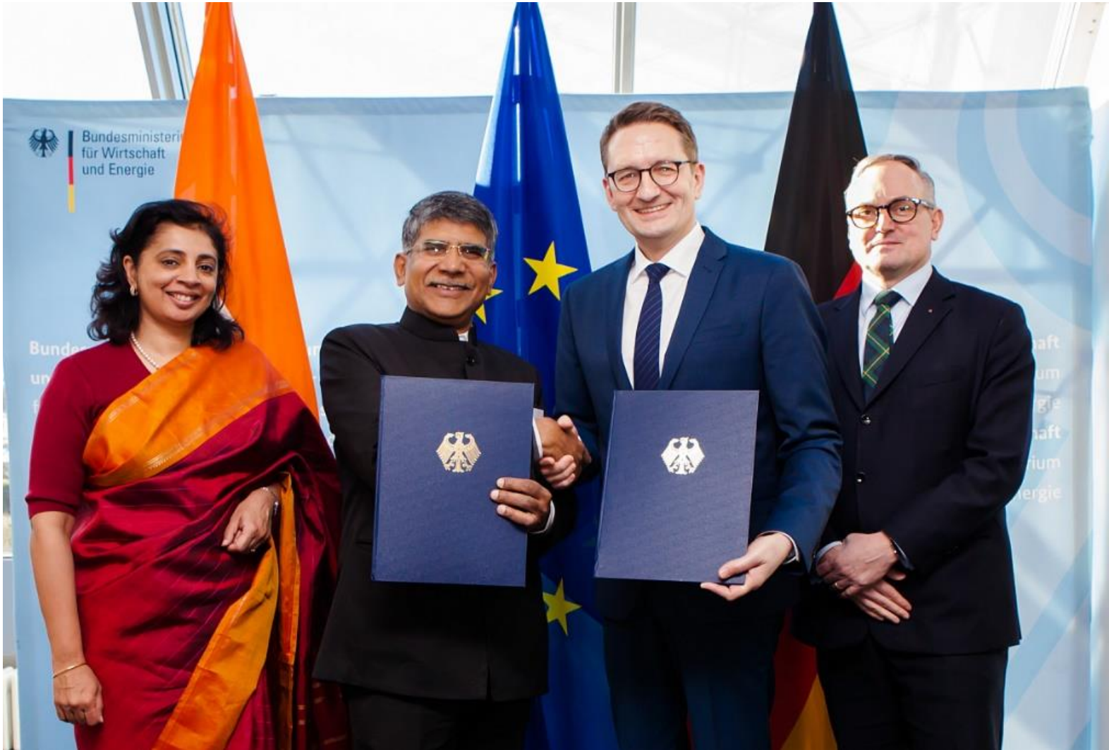
Annual Meeting of the Indo-German Working Group on Quality Infrastructure in January 2019, Berlin